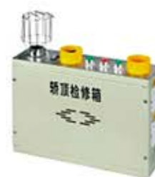
DT-2 轿顶检修箱 Top Inspection Box