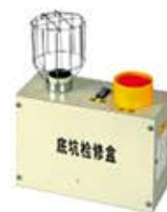
DT-2 底坑检修箱 Pit Inspection Box