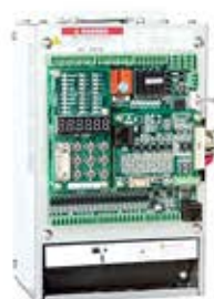
AS380 一体化控制器 Elevator Integrated Drive and Controller

MCP-SWF 8620 B Type Integrated Full Serial VVVF MRL Control Cabinet