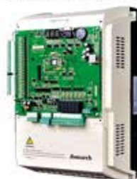
NICE3000 一体化控制器 NICE3000 Integrated Drive and Controller