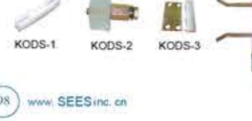
KOGS-5 KOGS-6 KOGS-7 KOGS-16 KOGS-10 KOGS-8 KOGS-9 KOGS-11 KOGS-12 KOGS-13 KOGS-14 KOGS-18A KODS-1 KODS-2 KODS-3