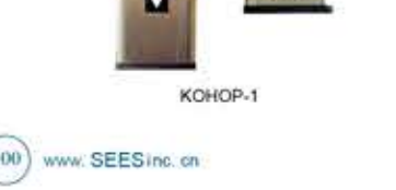
KOSS-1 KOSS-2 KOSS-3 KOSS-5 KOSS-7 KOWH-1 KOWH-1B KODIS-3 KODIS-15 KODIS-16 KODIS-17 KODIS-45 KOHOP-1 KOHOP-2 KOHOP-3 KOHOP-4 KOHOP-5 KOHOP-6