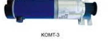
KOHR-11 KOHR-12 KOHR-13 KOHR-14 KOHR-15 KOHR-16 KOHR-17 KOHR-18 KOWH-19 KOWH-20 KOWH-21 KOWH-22 KOLO-1 KOLO-2 KOLO-3 KOLO-4 KOLO-5 KOLO-6 KOLO-8 KOMET-1 KOMET-2 KOMET-3 KODC-1 KODC-3 KODC-4 KOF-1